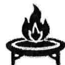
Propane Fire Pits

In an agency-developed recreation sites with pressurized water system